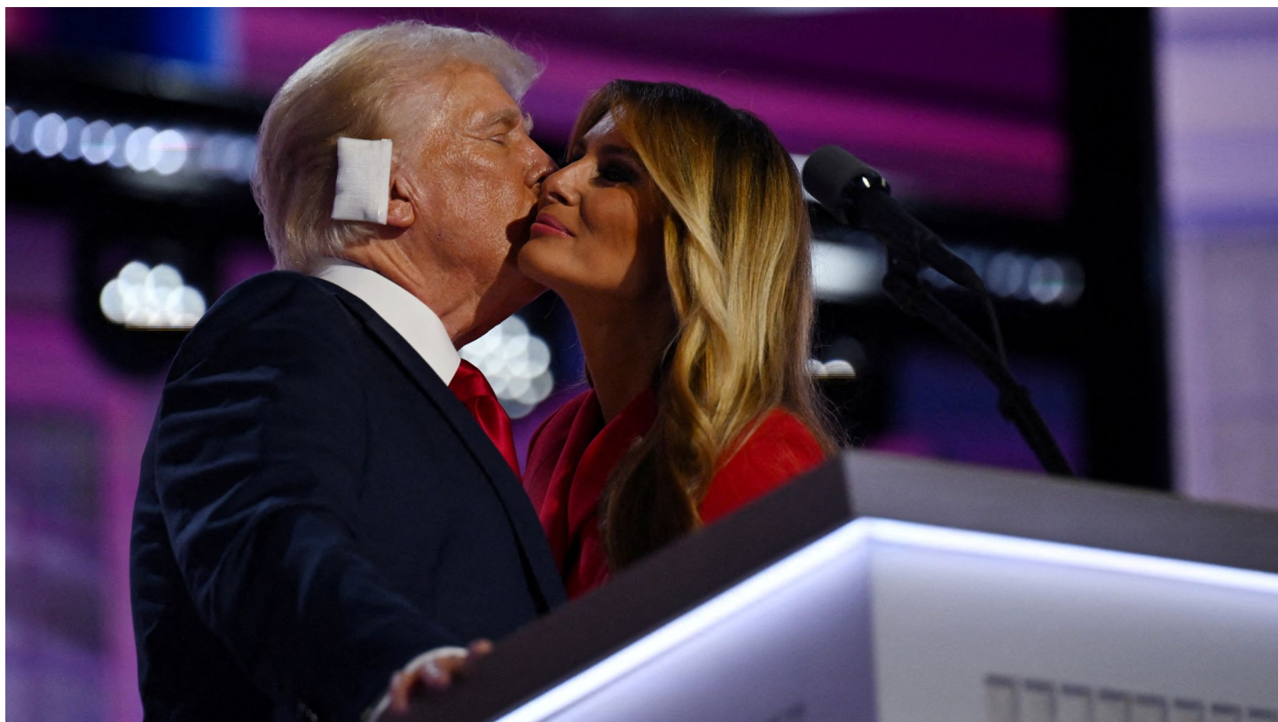
M Trump was joined on stage by his wife Melania

Mr Trump recalled he had been at the podium in the town of Butler and turned to refer to a screen displaying a chart.