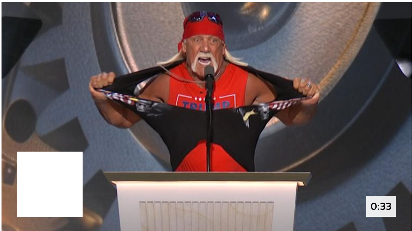
'They took a shot at my hero!'

Among the celebrities appearing at the convention to endorse Mr Trump was wrestler Hulk Hogan, who fired up the crowd by tearing his top in half to reveal a sleeveless red Trump campaign shirt.